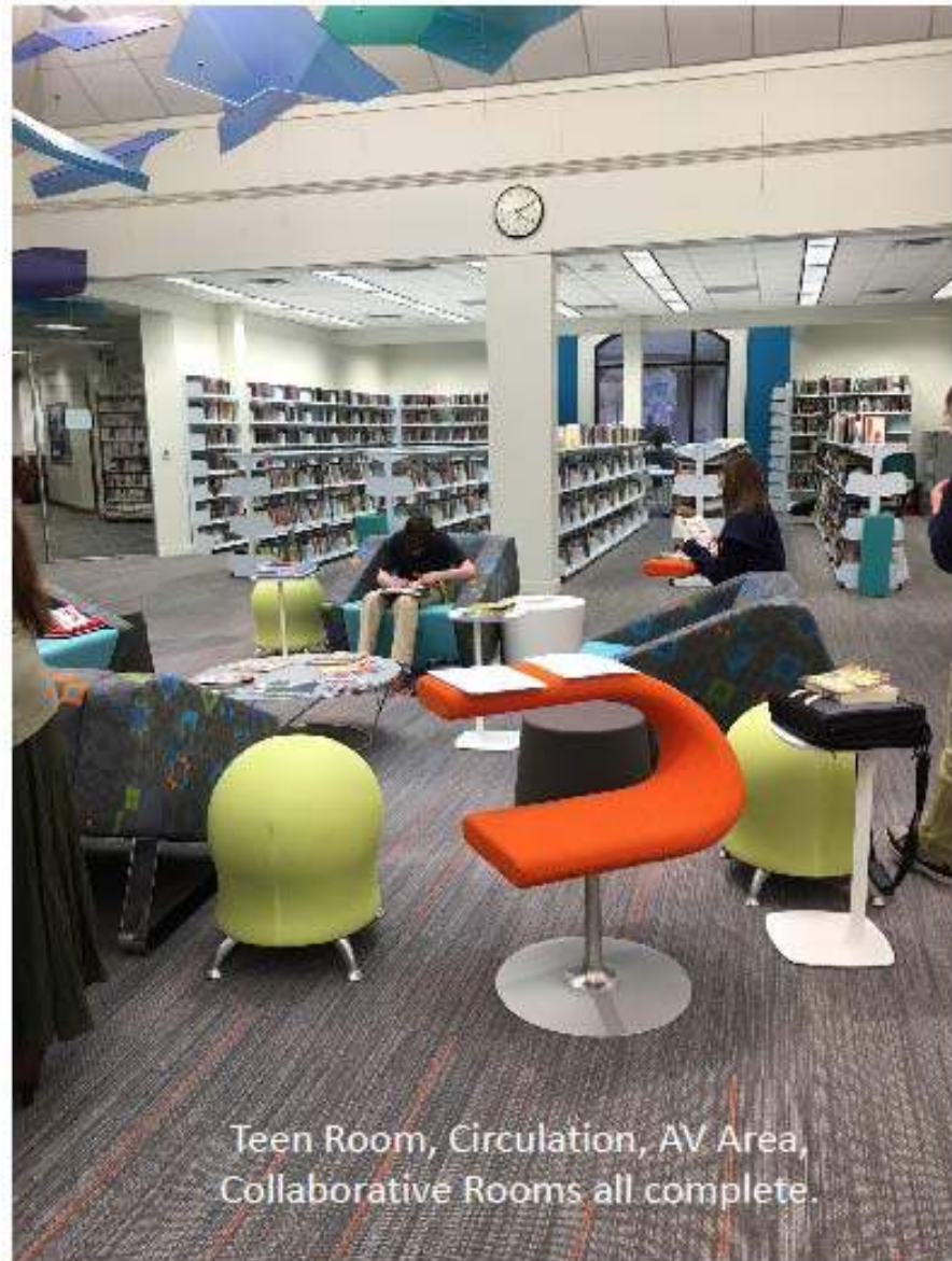
Teen Room, Circulation, AV Area, Collaborative Rooms all complete.