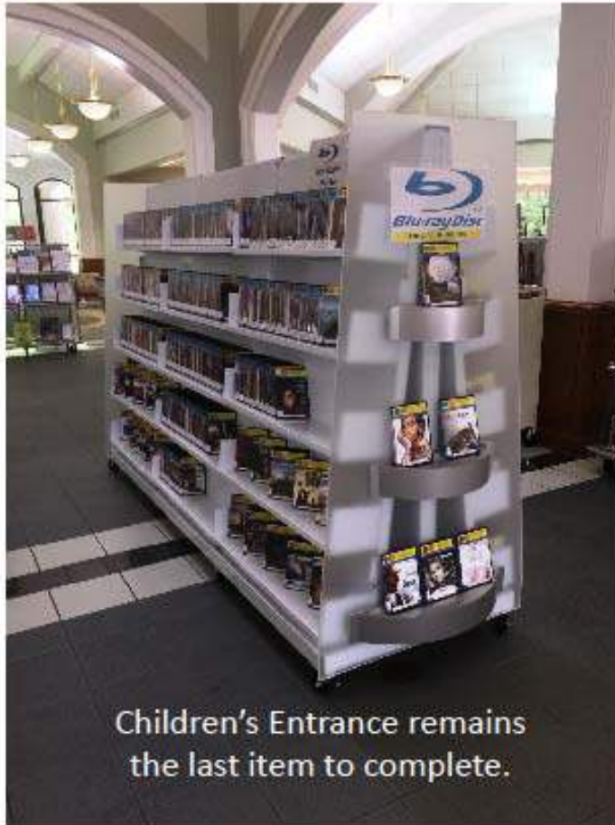
Children's Entrance remains the last item to complete.