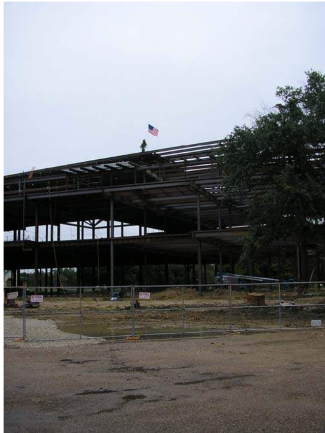
Tree Topping of Goodwood Main Library Construction July 11, 2012 at 10:30 a.m.