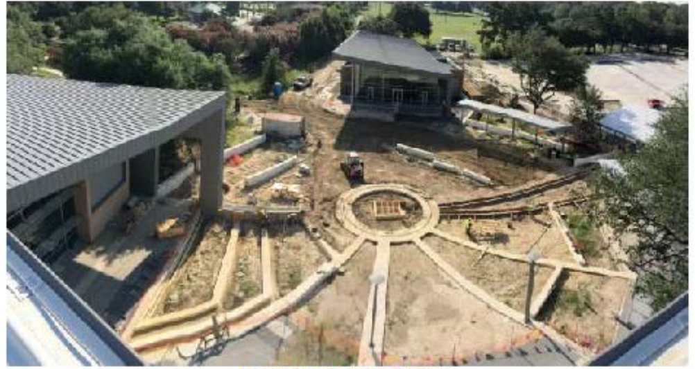
Looking from the roof to the Plaza.