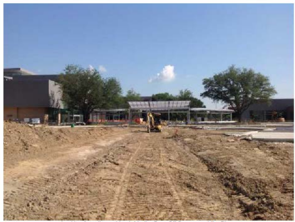
Looking from the parking lot to the Drop Off Canopy and the Plaza.