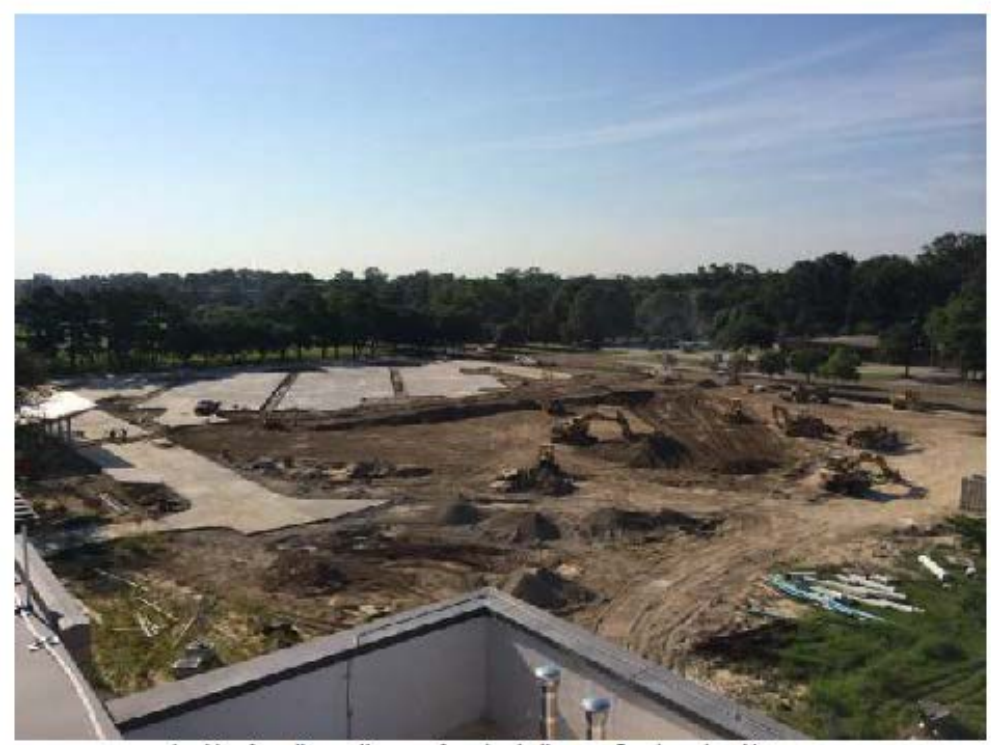
Looking from the southern roof garden to the new Goodwood parking area.