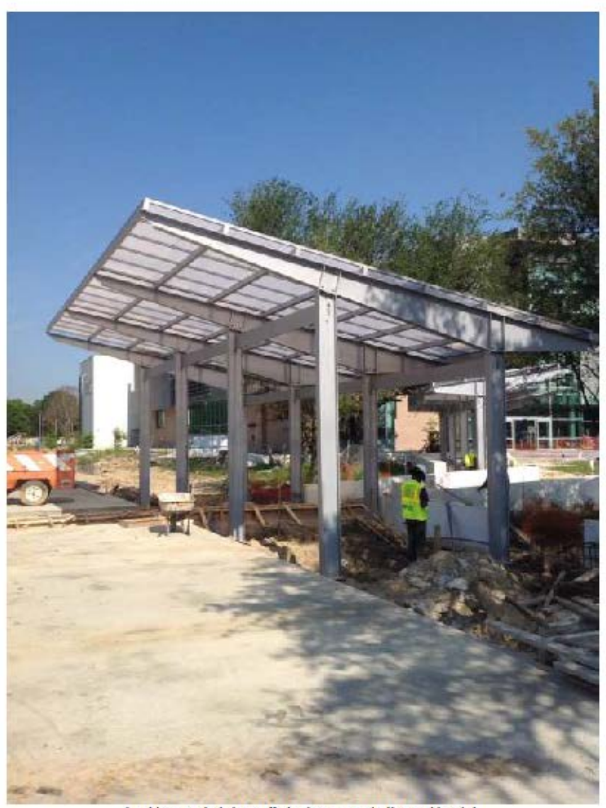
Looking west at drop off shade canopy in the parking lot.