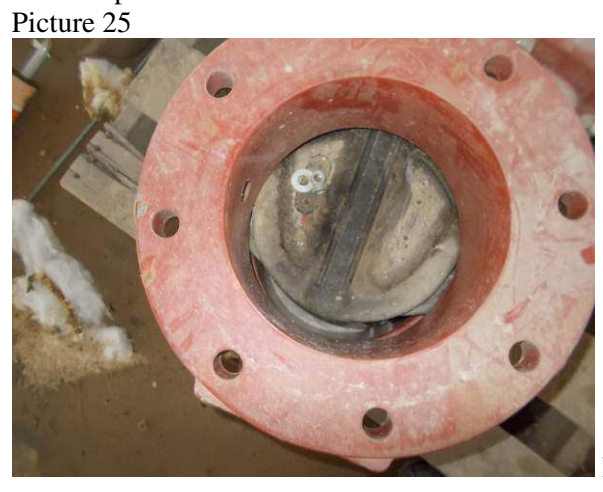
see next picture.

Protect stored valve. Clean before installation. Also