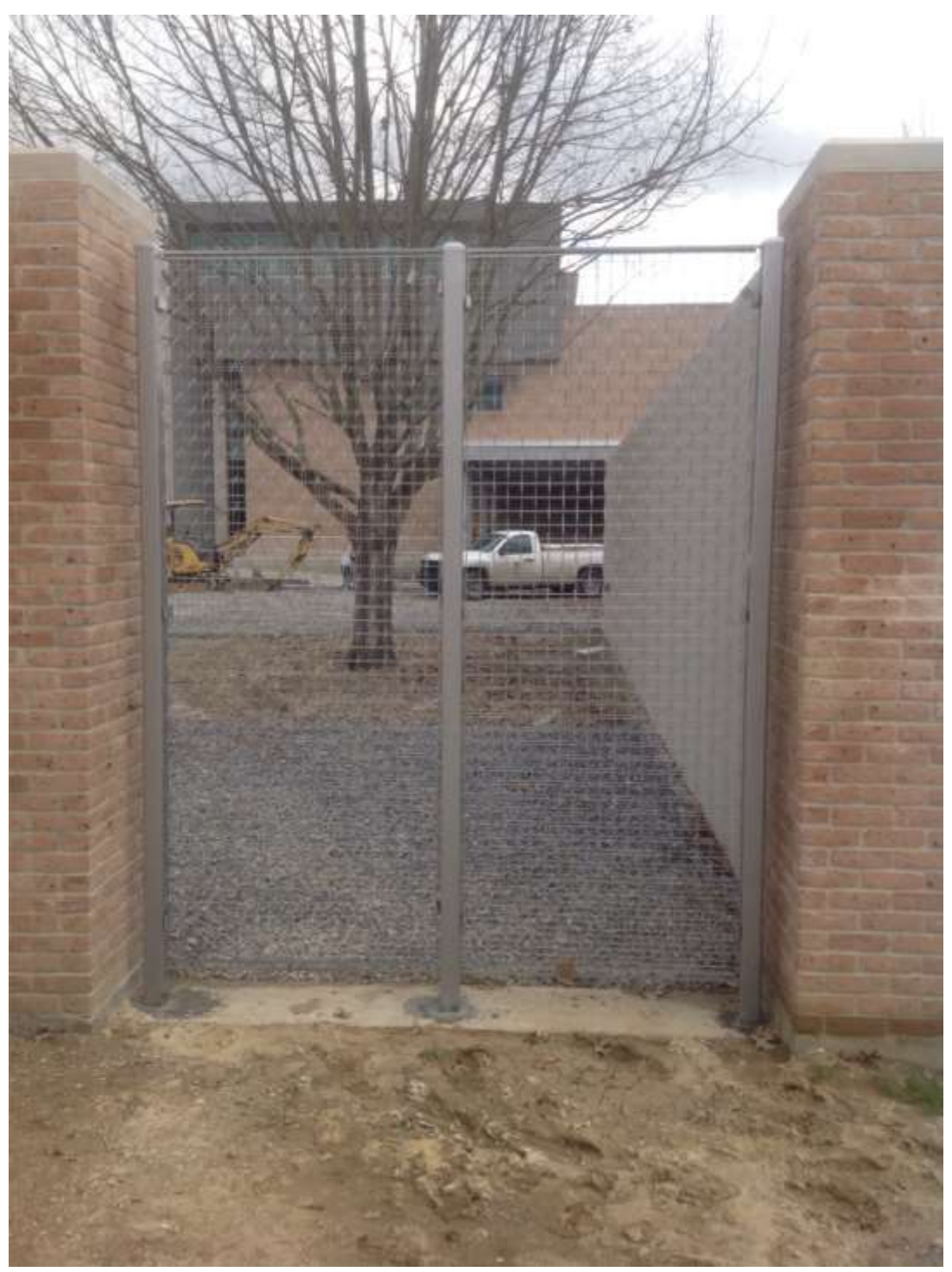
Looking toward a green screen.