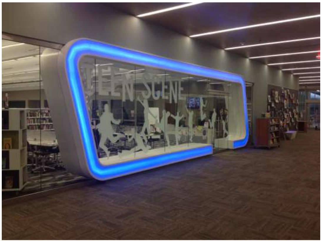
Looking toward Teen Scene Entry.