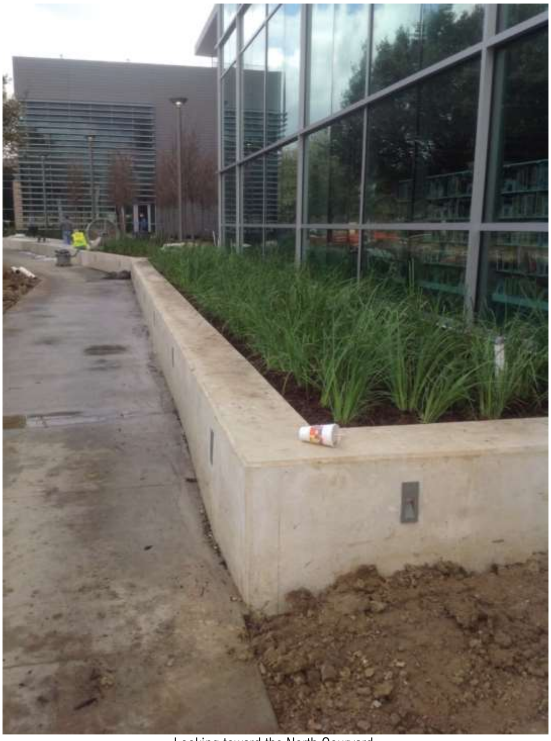
Looking toward the North Couryard.