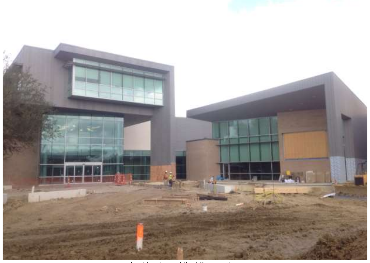
Looking toward the Library entry.