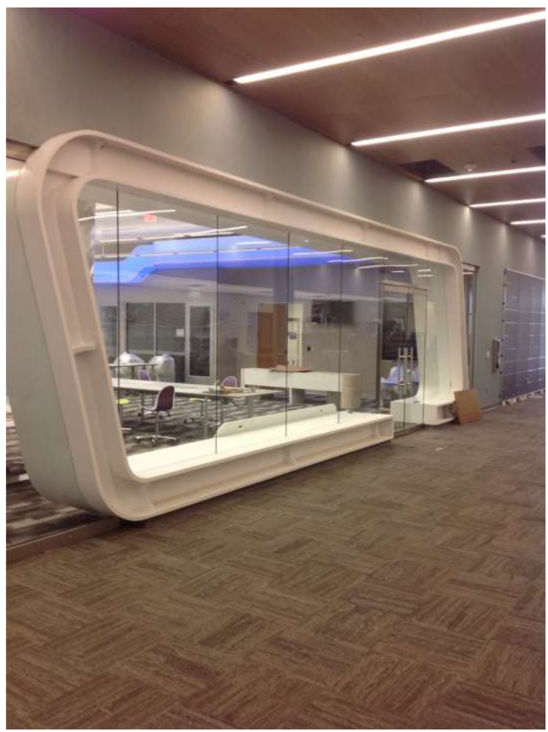
Looking toward the Teen Entry.