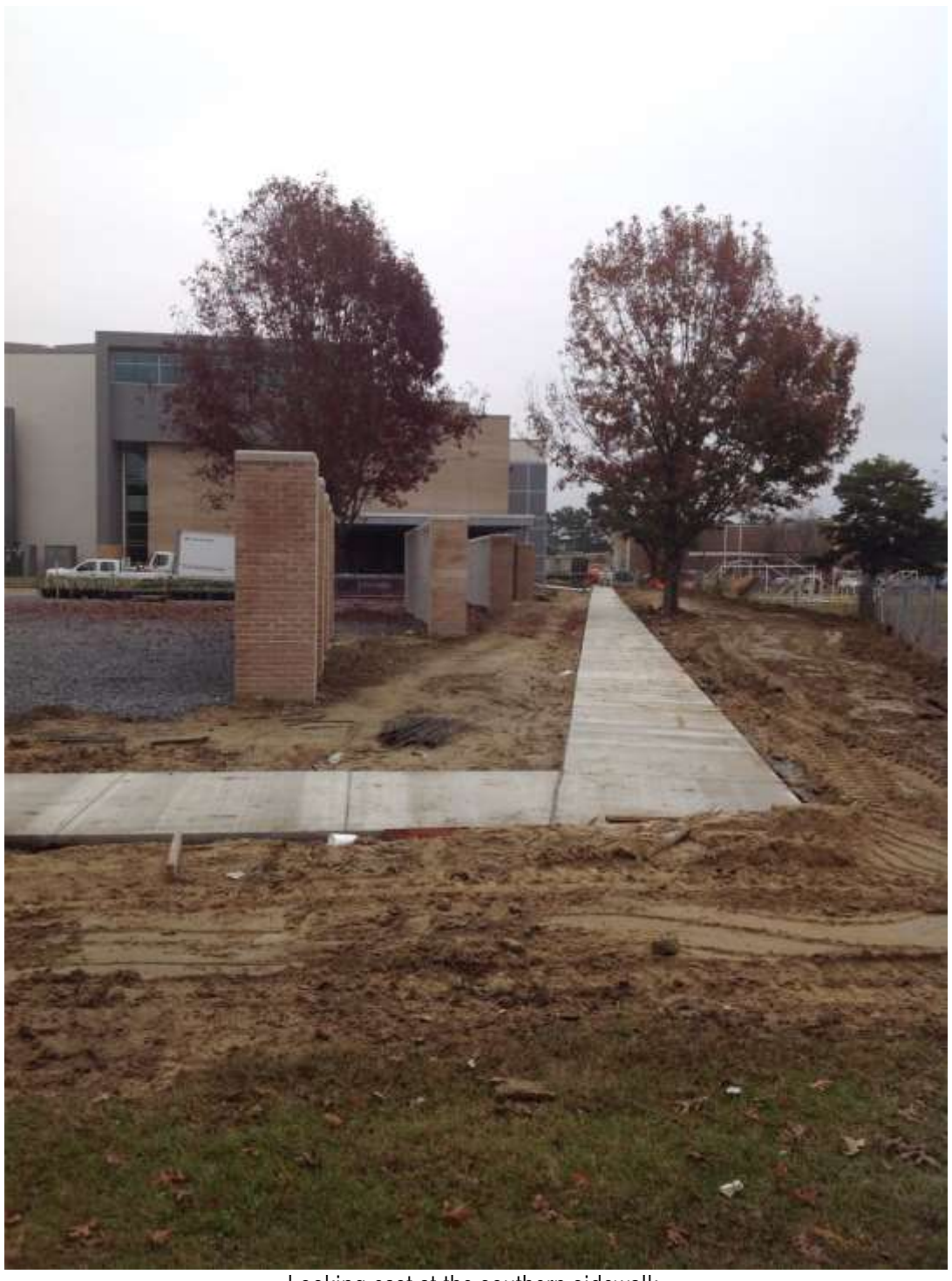
Looking east at the southern sidewalk.