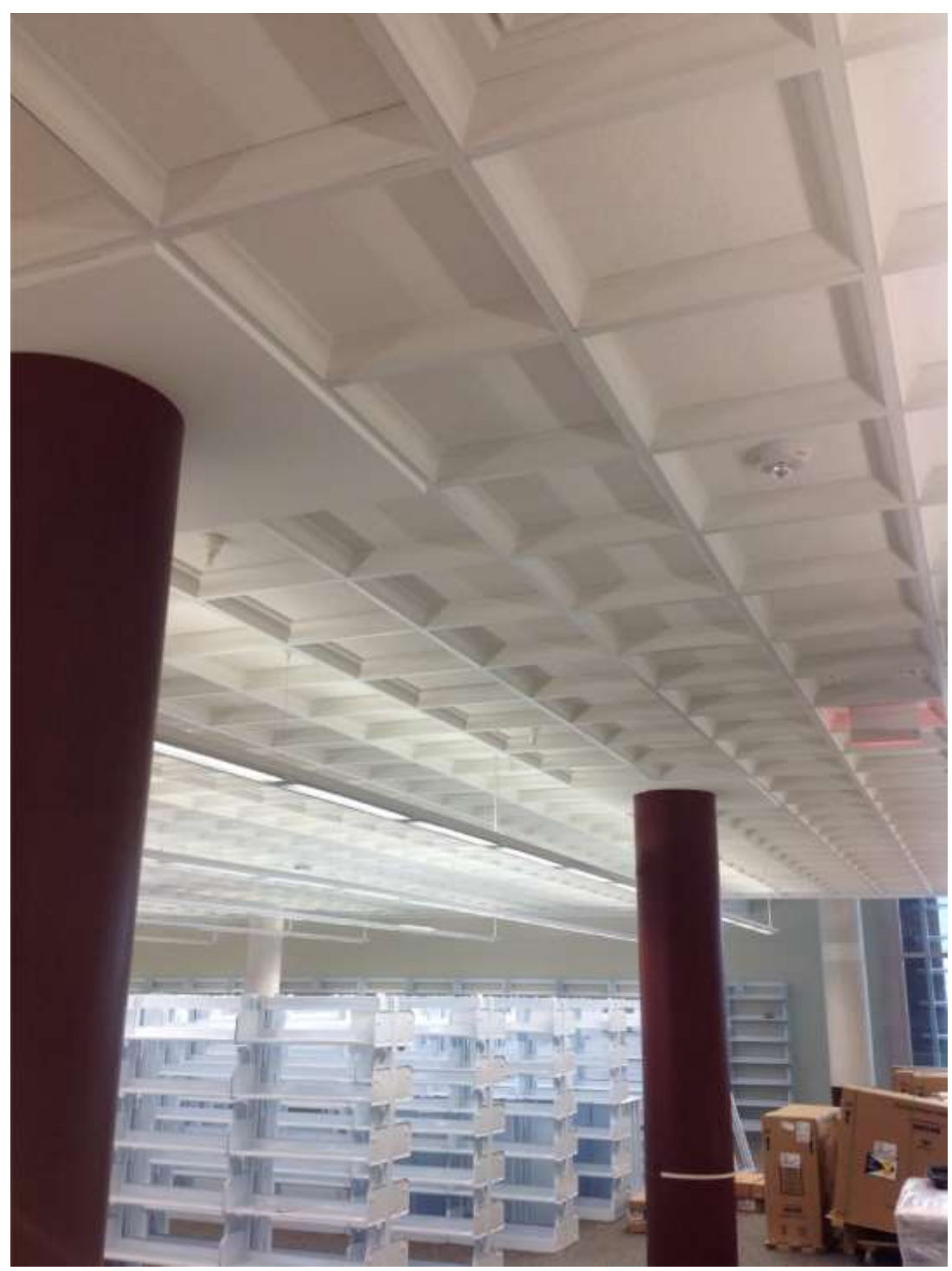
Looking into the Genealogy Collection.