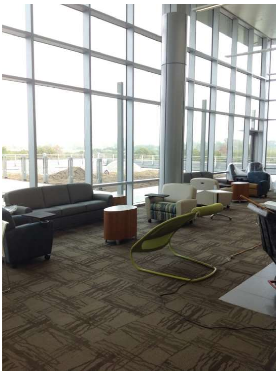
Looking out to the Roof Terrace from the Staff Lounge.