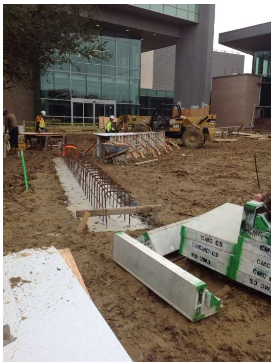
Looking west toward the library entry from the Plaza.