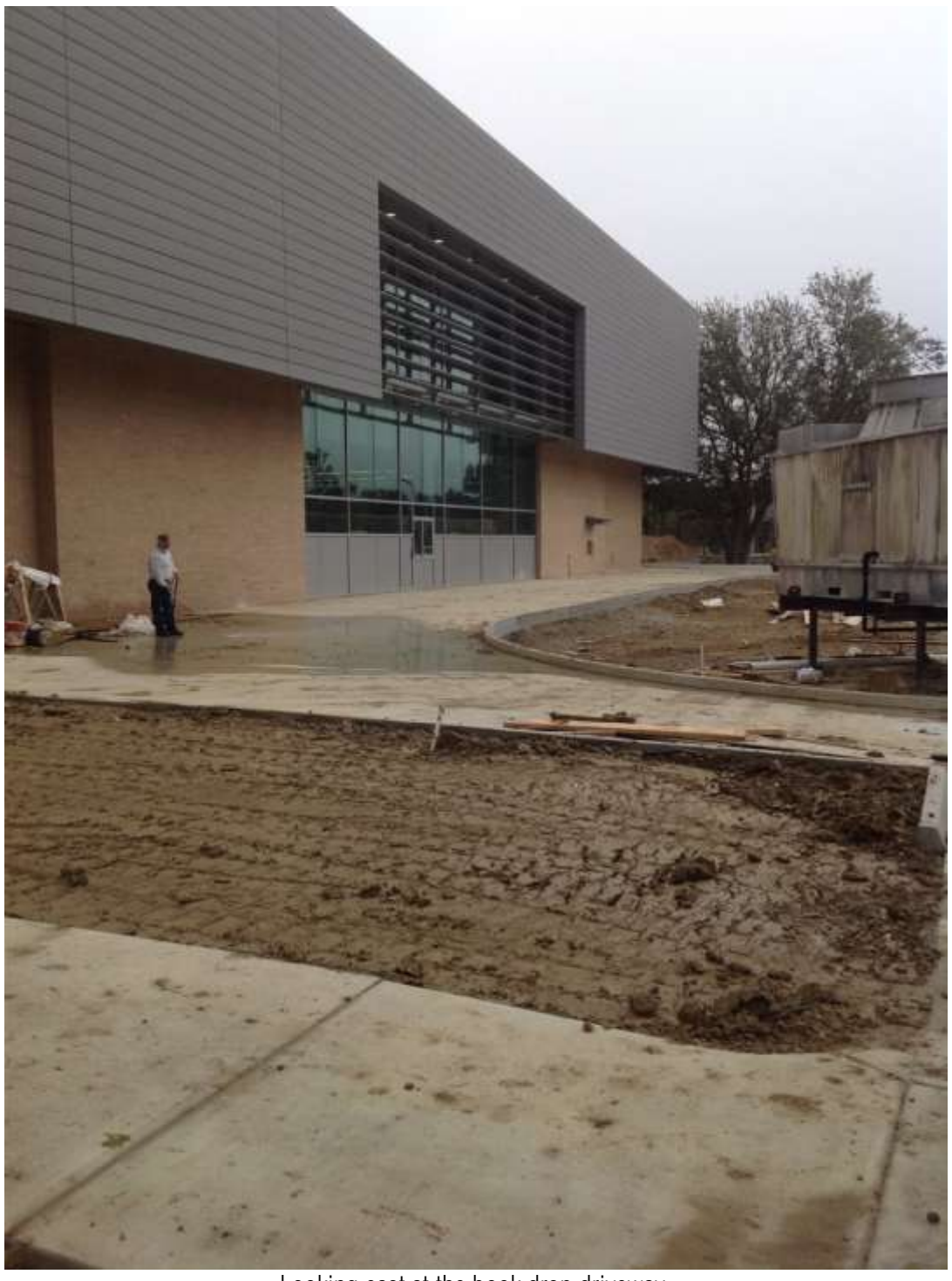
Looking east at the book drop driveway.