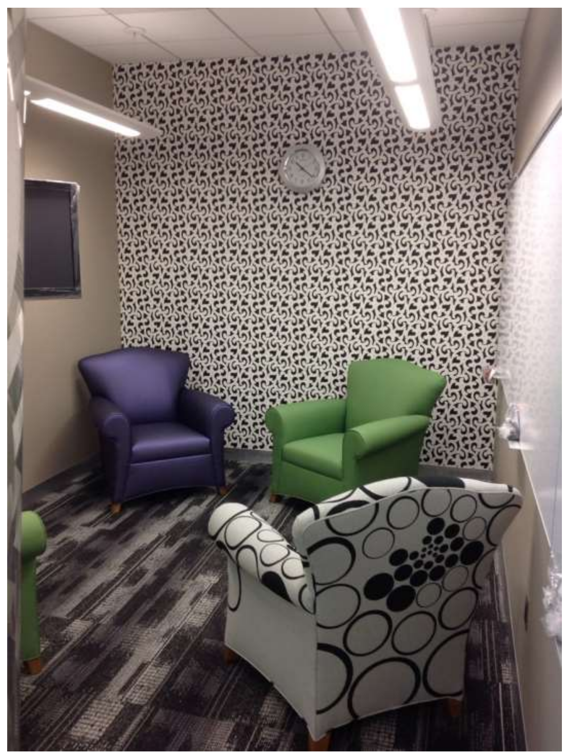
Looking into one of Teen study rooms.