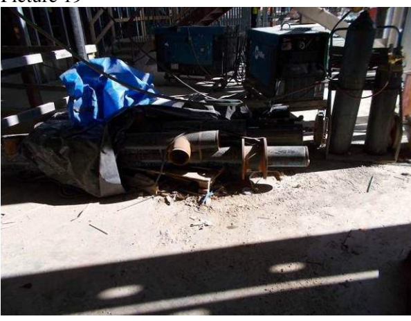
Pipe & valves not protected.