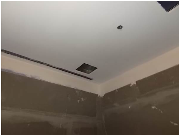
Exhaust fan openings in ceiling of Women 108 and Men 109 not protected.