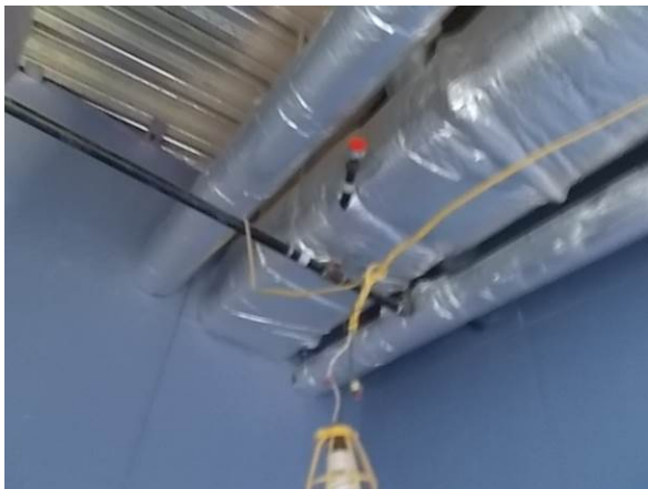
Separate sprinkler line from duct and reinsulate as needed. Provide sufficient space for duct insulation.