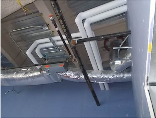
Man Office 354 Add additional pipe supports at main pipe elbows.