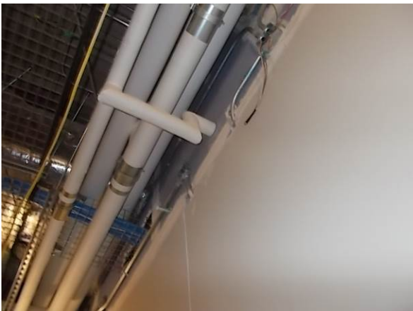
Pipe insulation is not continuous through wall penetration