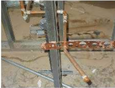
Bent copper pipe