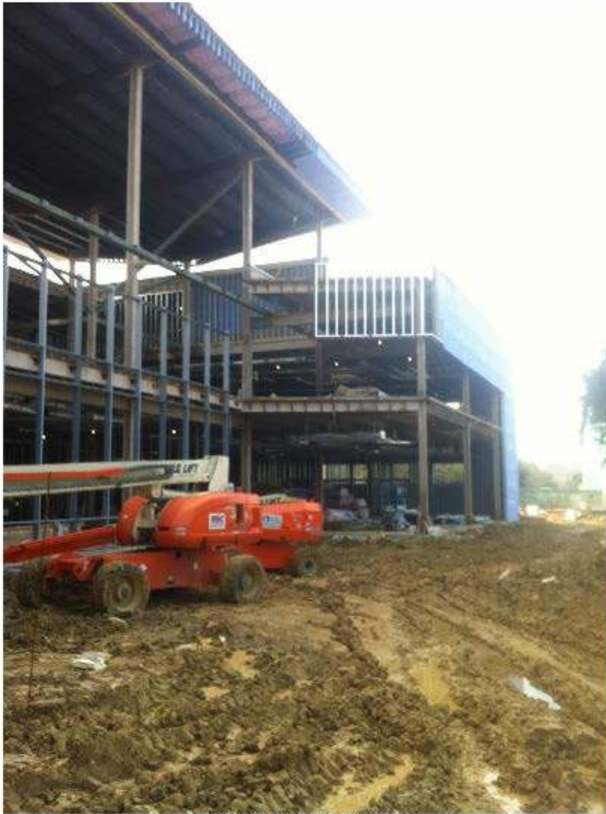
Looking west in the North Courtyard