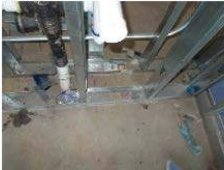
Clean cans, cigarette pack, debris from wall framing prior to installing sheet rock.