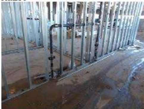
Protect open pipe