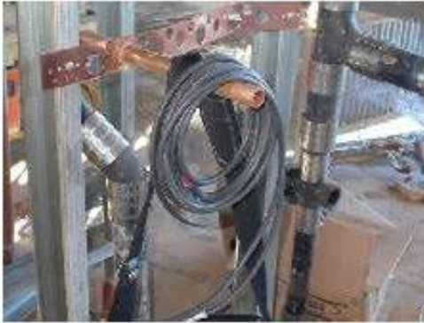
Water line pipe end not capped