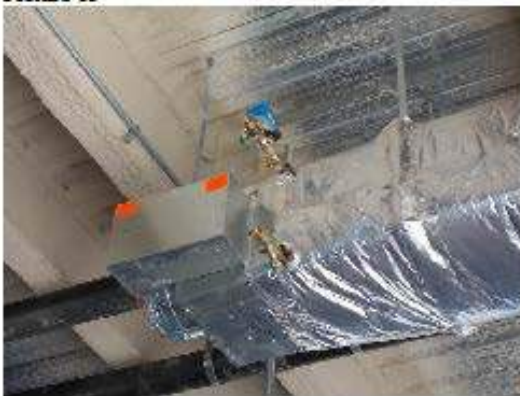
Protect open pipe and valves.