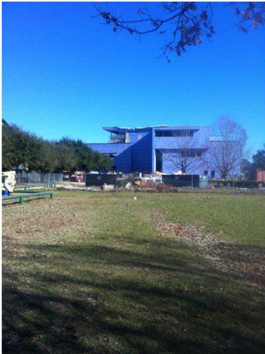
Looking east toward the Library from the soccer fields