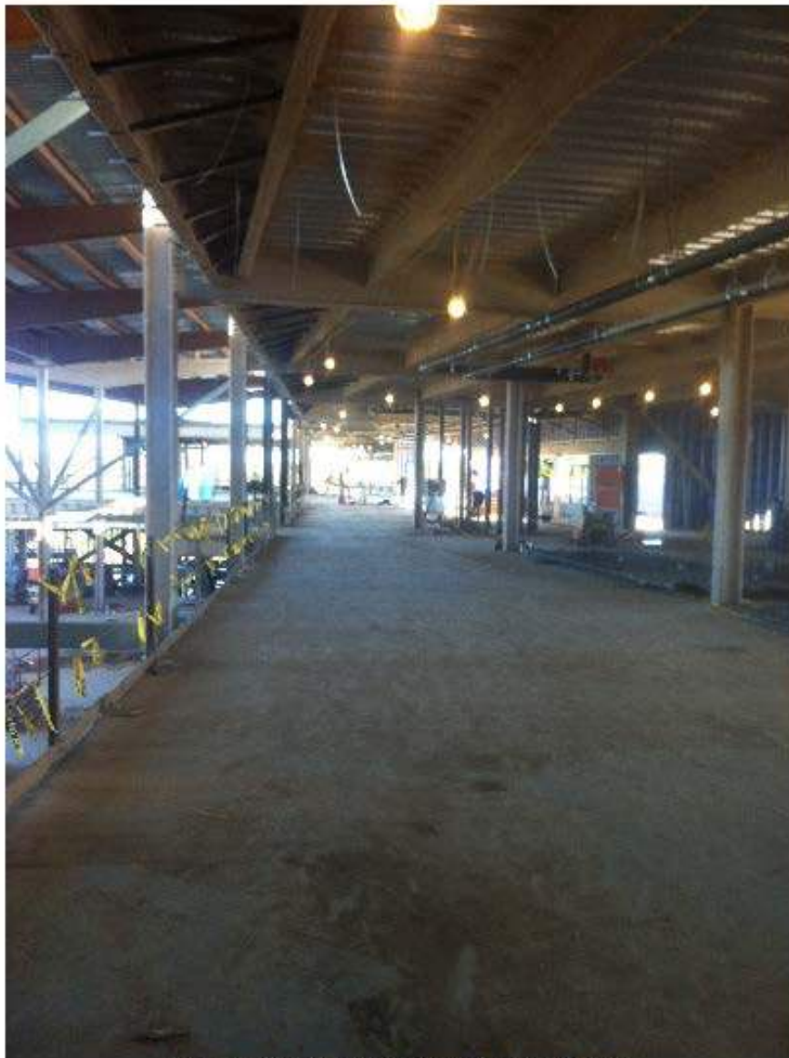
Looking east toward the main corridor on the third floor