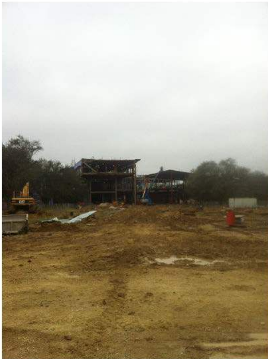
Looking west toward the Library's main entry from the Plaza