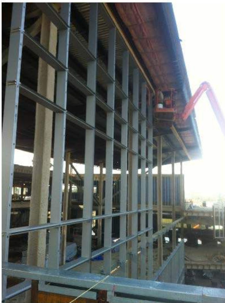
Looking toward the west from the public green roof