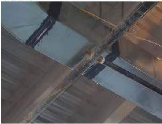
Protect open pipe.